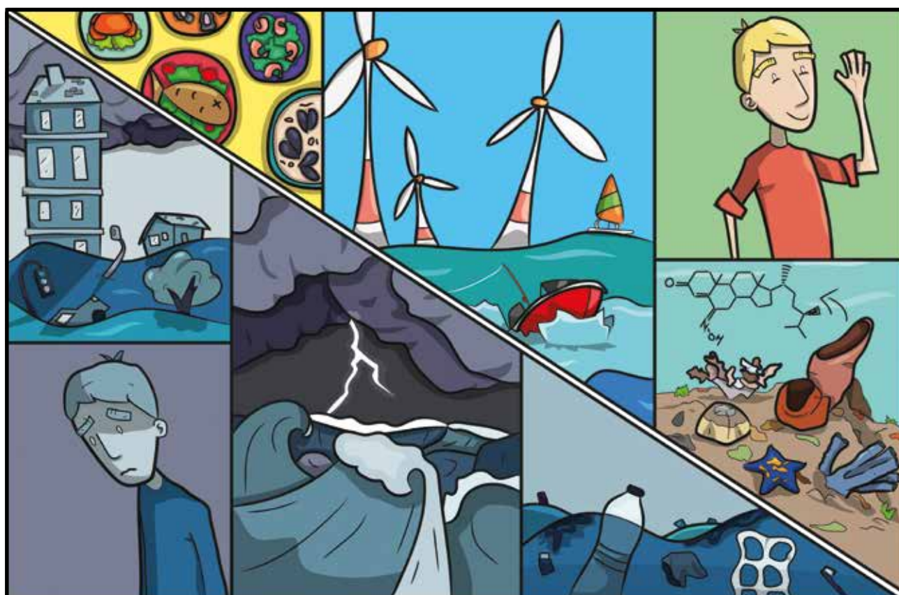
Human activities that impact the ocean in turn impact human health. These impacts can be beneficial, such as those from food, renewable energy, recreation, and biomedical research, but can also be negative, such as those associated with floods, storms, and pollution.

The 2014 Message from Bedruthan 3 called for a review of the OHH policy landscape. The policy report 4 and Strategic Research Agenda 5 (see box overleaf), which form the basis for this Policy Brief, arise from that call.