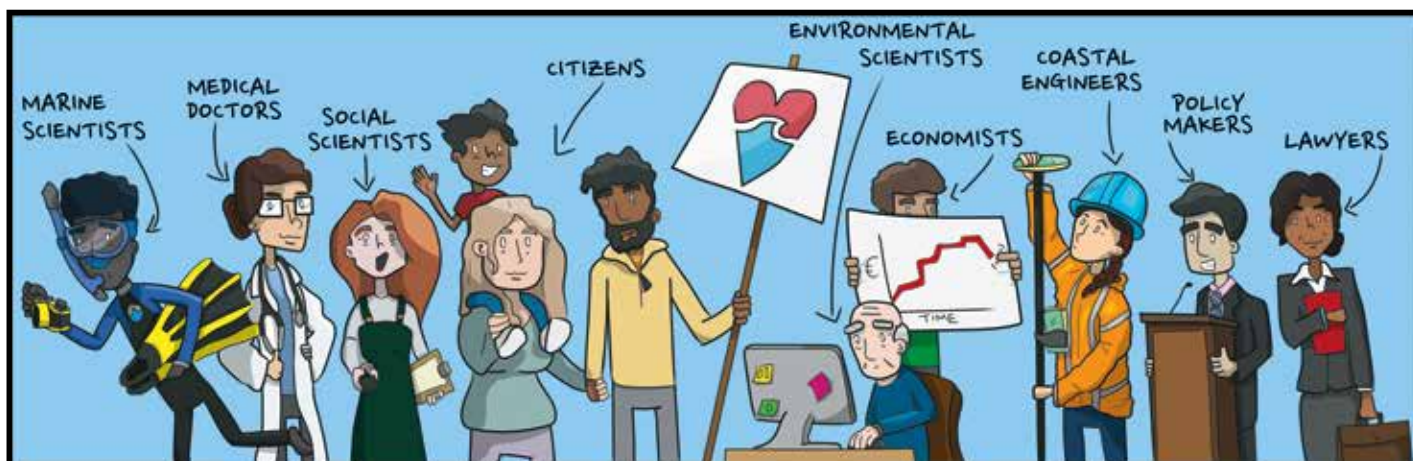
The study and practice of Oceans and Human Health requires collaboration across many backgrounds such as those shown here.