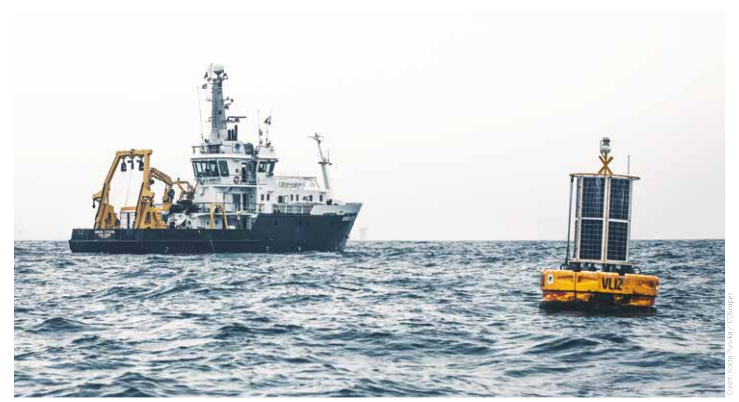
RV Simon Stevin participating in the Integrated Carbon Observation System (ICOS) initiative

An example of this is the Multidisciplinary drifting Observatory for the Study of Arctic Climate (MOSAiC) Expedition<sup>1</sup> where the RV Polarstern will spend an entire year frozen in the ice, starting in the autumn of 2019. Exploration of these relatively unknown and unseen areas can also generate fascination for the ocean amongst the public. Therefore, research vessels and their equipment can serve as gateways to wider conversations about the ocean, and serve as tools for furthering Ocean Literacy.