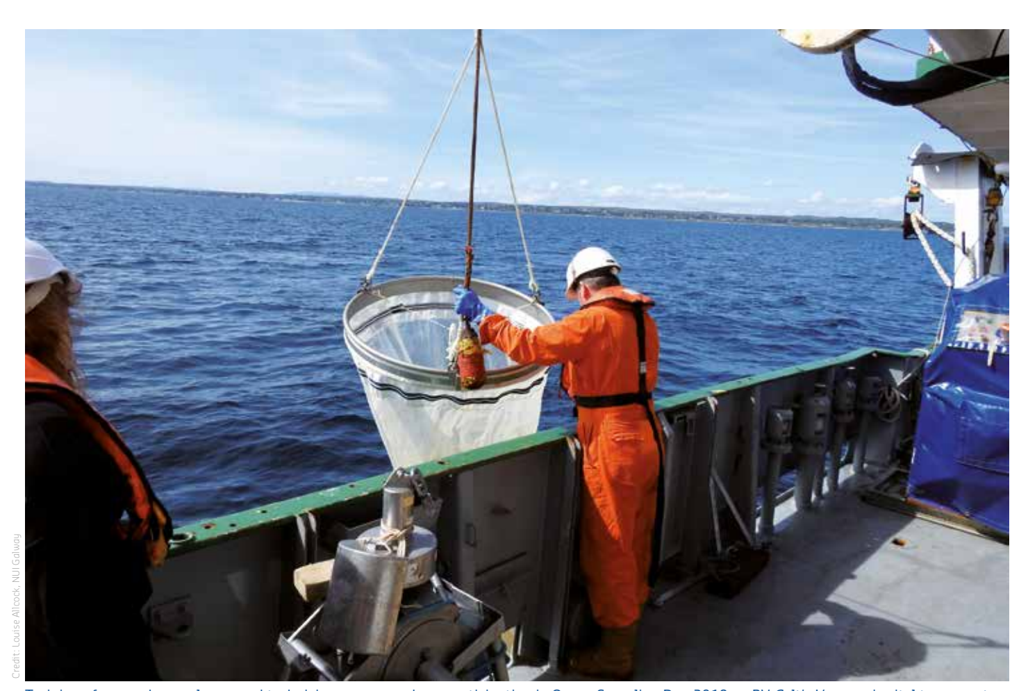
Training of research vessel crew and technicians, as seen above participating in Ocean Sampling Day 2019 on RV Celtic Voyager is vital to support the needs of science.

The future needs, in terms of human resource capacity, should therefore be assessed and approaches for attracting people to these career paths should be investigated. Research vessels and their innovative equipment may serve as a first point of interest for the younger generation in raising awareness about the ocean and ocean related careers.