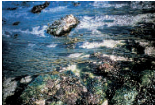
Rocky shores in north and western Europe harbour with a rich biological community dominated by large seaweeds of the genus Laminaria .

biotechnological techniques. Their study requires experimental protocols for regulation and management of genetically transformed biota especially in aquaculture, natural products with applications in food processing and human health, and requirements for legislating patents on organisms and processes.