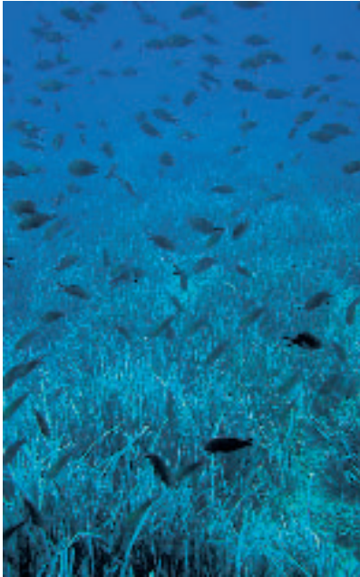
Seagrass meadows, such as the Posidonia oceanica meadow shown, provide important services in the ecosystem, such as habitat for fauna and physical protection of the coastal zone.