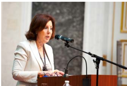
Maria da Graça Carvalho, MEP & Rapporteur for the Horizon 2020 Specific Programme

Navigating the Future IV also calls for a quantum leap forward in the integration of European marine research to allow for the scale of investment and collaboration necessary to meet the major challenges in achieving effective ocean stewardship, while creating a platform for blue growth.