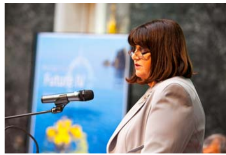
Máire Geoghegan-Quinn, EU Commissioner for Research, Innovation and Science

Speaking at the event, Máire Geoghegan-Quinn, EU Commissioner for Research, Innovation and Science explained, “The Marine Board plays a major role in promoting marine science and technology in Europe which is vital for achieving sustainable ocean science and management. The launch of Navigating the Future IV is particularly timely as we prepare for the first Horizon 2020 programme. Navigating the Future IV will be a valuable source of ideas and common priorities in the area of marine sciences, providing a vision for science and technology in Europe.”